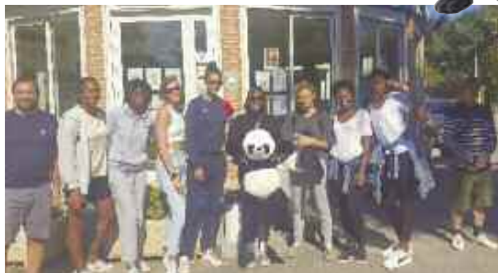
Équipe de France féminine d'escrime en stage